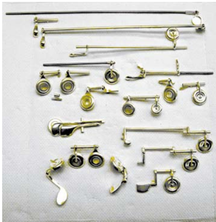
Below: Key parts ready to be fitted on the flute body.