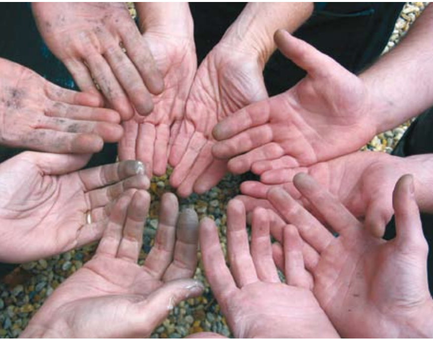
The hands that made the keys.

When I started making flutes, the steel used for the steel rods was called W-1, or water-hardening tool steel. It is a good, general purpose steel, but it has one major flaw. It rusts. In those days, stainless steels were not well-known outside of engineering suites. Today, we have very good choices for stainless steels and most flutemakers have moved to using them thereby avoiding keys binding due to oxidation.