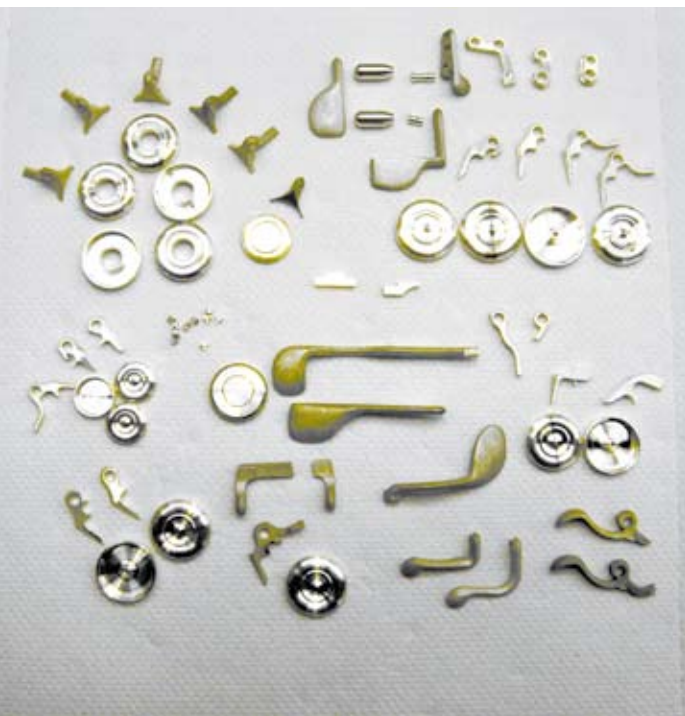
Below: Key parts partly finished.

harden. These waxes are attached to a rod of the same wax called a sprue. When the sprue has all its waxes attached, it looks like a poplar tree with up-pointing branches. The sprue base is attached to a plastic base to hold it upright. A metal tube called a flask is placed around this assembly and plaster is poured in submerging the sprue and waxes. Once the plaster hardens, the plastic base is removed. Now the caster has a cylinder of plaster with waxes and sprue inside encased in a metal flask. One end of the flask shows just plaster. The other end has the bottom of the sprue extending out. Now, the flask, plaster, sprue and waxes are placed in an oven that melts out the wax and raises the temperature of the plaster to well over 1000° Fahrenheit or about 540° Celsius, depending on what metal is being used. The wax melts out of the hole at one end of the flask. When the plaster has reached temperature, the molten metal from which the keys will be made is poured into the hole left by the sprue. The metal fills the voids left by the waxes. In a few minutes, the metal has solidified and the flask is plunged into a bucket of water. The plaster, still being quite hot, fractures and, for the most part, falls off the castings. The castings are cut off the sprue and are ready to be made into keys. While cast keys can be hardened using heat-treatment, it is difficult to achieve the hardness imparted by the 'cold-work' of forging.