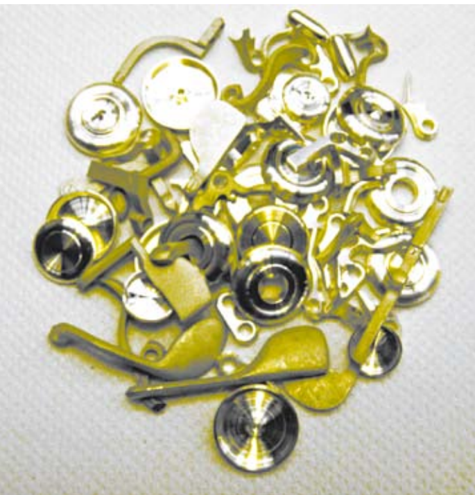
Above: A pile of key parts.